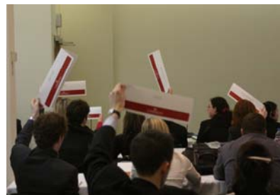
Young ambassadors taking their role seriously!