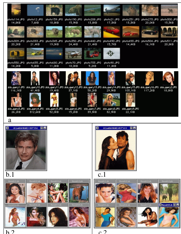
Figure 2: a. The test sets of photographic and skin images. b.1-b.2 Typical skin query and corresponding result. c.1-c.2 Typical skin query and corresponding result.

To classify images into photographic and synthetic images, we used the k-nearest neighbor classifier. We assessed the precision of the automated image type classification method, for a training and test set of 200 and 50 images respectively from each class. The test sets of photographic and synthetic images are shown in Fig. 1.a. Typical queries are shown in Figs. 1.b.1 and 1.c.1. The corresponding results, based on saturation and edge strength, are shown Figs. 1.b.2 and 1.c.2. Based on edge strength and saturation the 4-nearest neighbor classifier provided a classification success of 90% (i.e. 90% were correctly classified) for photographic images and 85% for synthetic images. From the results it is concluded that automated type classification provides satisfactory distinction.