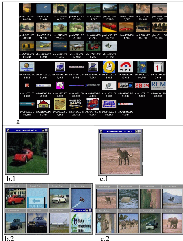
Figure 1: a. The test sets of photographic and synthetic images. b.1-b.2 Typical photographic query and corresponding result. c.1-c.2 Typical synthetic query and corresponding result.

After classifying images into photographic and synthetic images, we further classify photographic images into portraits (the image contains a (substantial) face), indoors (images are taken from indoor scenes), outdoors (images are taken from outdoor scenes). Further, synthetic images are classified into button or non-button images.